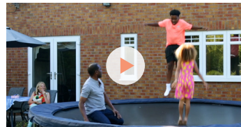
What are the steps to becoming a foster parent?

The videos can be watched individually or all together. You'll hear foster parents sharing their experiences and helping you understand what to expect.