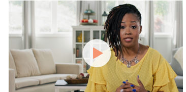
What is foster care?