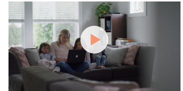
What will foster parenting be like?