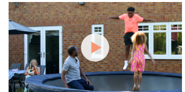
What are the steps to becoming a foster parent?

The videos can be watched individually or all together. You'll hear foster parents sharing their experiences and helping you understand what to expect.